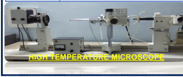
HIGH TEMPERATURE MICROSCOPE