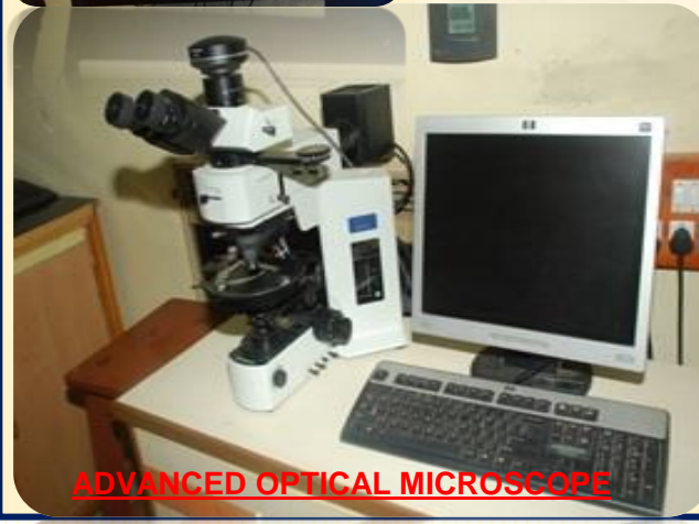
ADVANCED OPTICAL MICROSCOPE