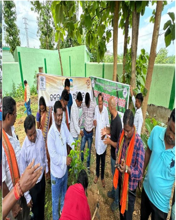
6. Rural school connect program at upper primary school, Dalposh, 10 Aug 2024 Rural school connect program at upper primary school, Dalposh, 10 Aug 24