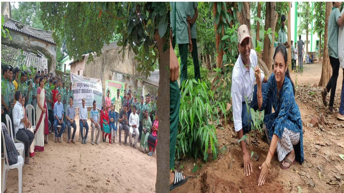
5. Van mahotsav at Hatibandha High School, 17 July 2024 Van mahotsav at Hatibandha High School, 17 July 24