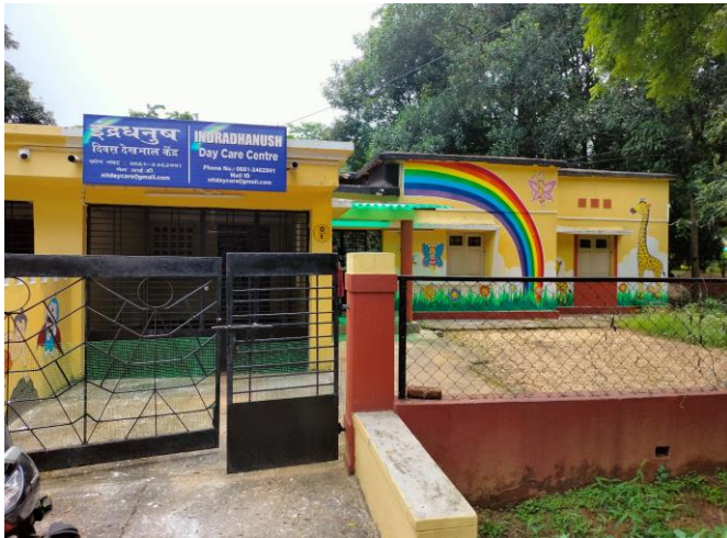
Entrance to the centre