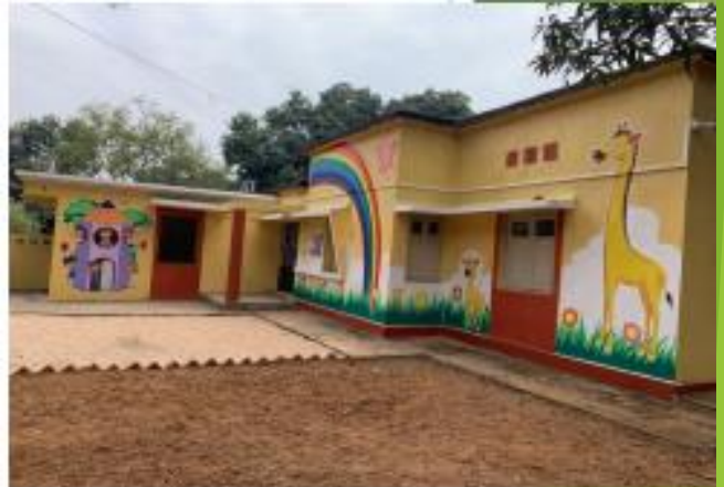
Sand filled play area